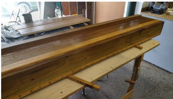
The refurbished pedal wind chest. The pipes sit inside this organ

Here are some new photos provided by the Rosenberry and Myers organ builders. We are nearing completion!